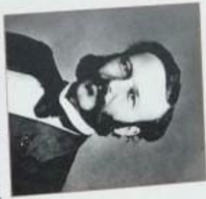
Jean Henry Dunant Founder of Red Cross (1828-1910)

To MANUEL SRINIVAS NAHAK INSTITUTE OF MANAGEMENT BONDEL, MANGALORE