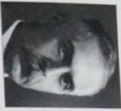
Karl Landsteiner Discoverer of ABO Blood Group System 1900

Located in Govt. Lady Goschen Hospital Premises, Mangaluru - 575001 Ph: 2410787, 2424788 Email: bblrscdkd@gmail.com