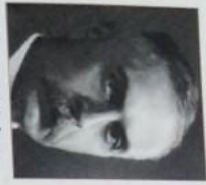
Karl Landsteiner Discoverer of ABO Blood Group System 1900

Located in Govt. Lady Goschen Hospital Premises, Mangaluru - 575001 Ph: 2410787, 2424788 Email: bblrscdkd@gmail.com