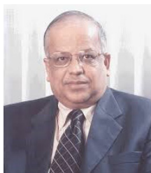
Mr. V. Leeladhar Former Deputy Governor Reserve Bank of India INDIA