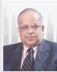
Sri V. Leeladhar Former Deputy Governor Reserve Bank of India